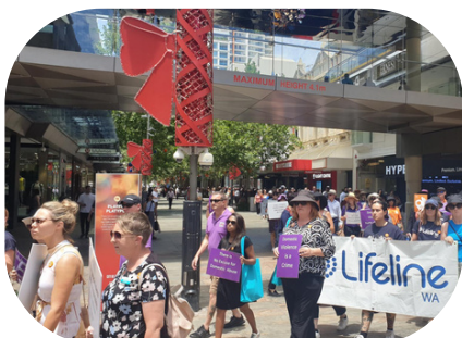
16 Days in WA 2022 launch

Stopping Family Violence team participating in the 32nd annual Silent March during the 2022 16 Days in WA.