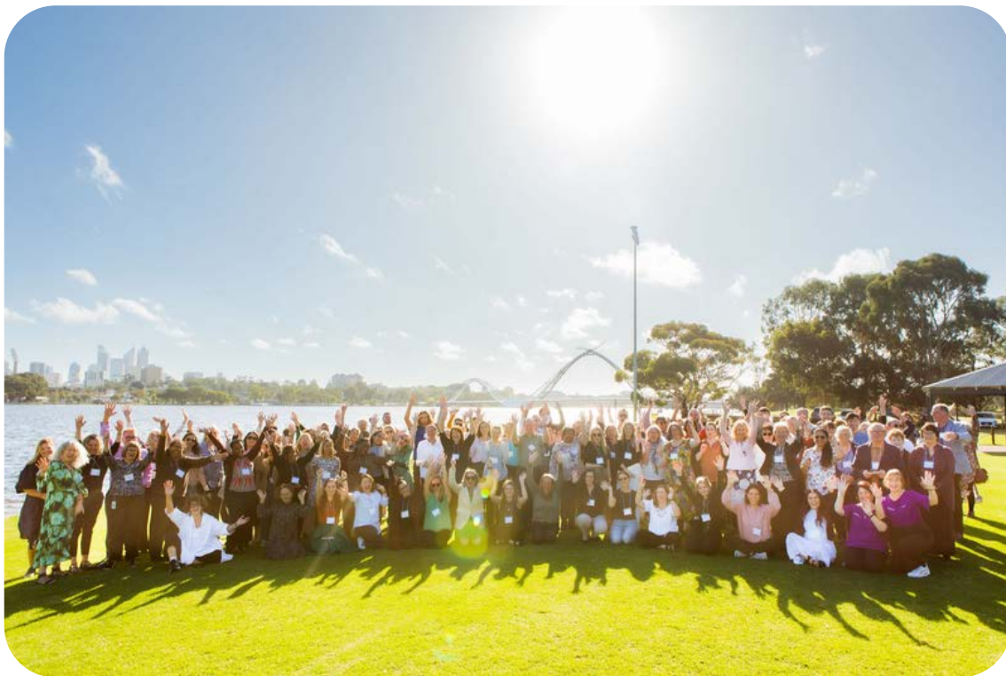
Stopping Family Violence team attending the 2022 Family Law Pathways Conference.

Impact: The WA Family Law Pathways Network hosts an annual conference for those working in the family law system to help improve their practice so they can assist with families who have separated or are separating.